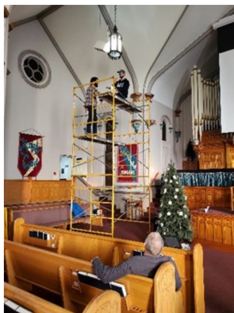
Two Presbys and a Trustee to supervise.