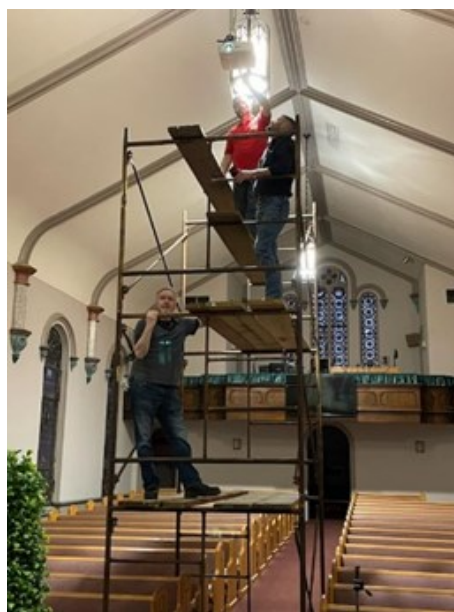
Aligning the projector with the screen will keep the Media Team happy.