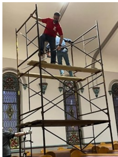
They DO look like monkeys!

Thank you to ALL involved in these very important projects.