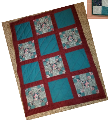
One Quilt ... Front and Back