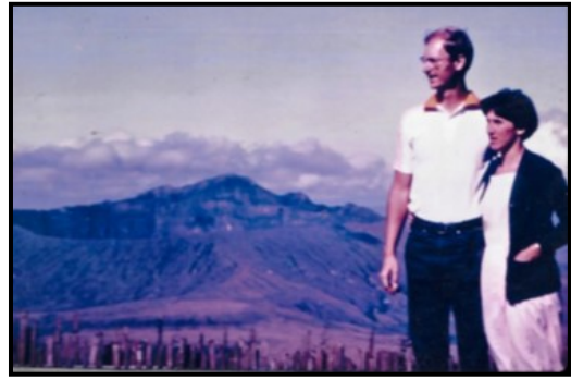
Kenya Rift Valley Mount Longonot