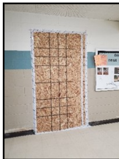
Elevator doorway in Fellowship Hall