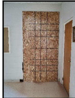
Walkway door to sanctuary across from the church offices.